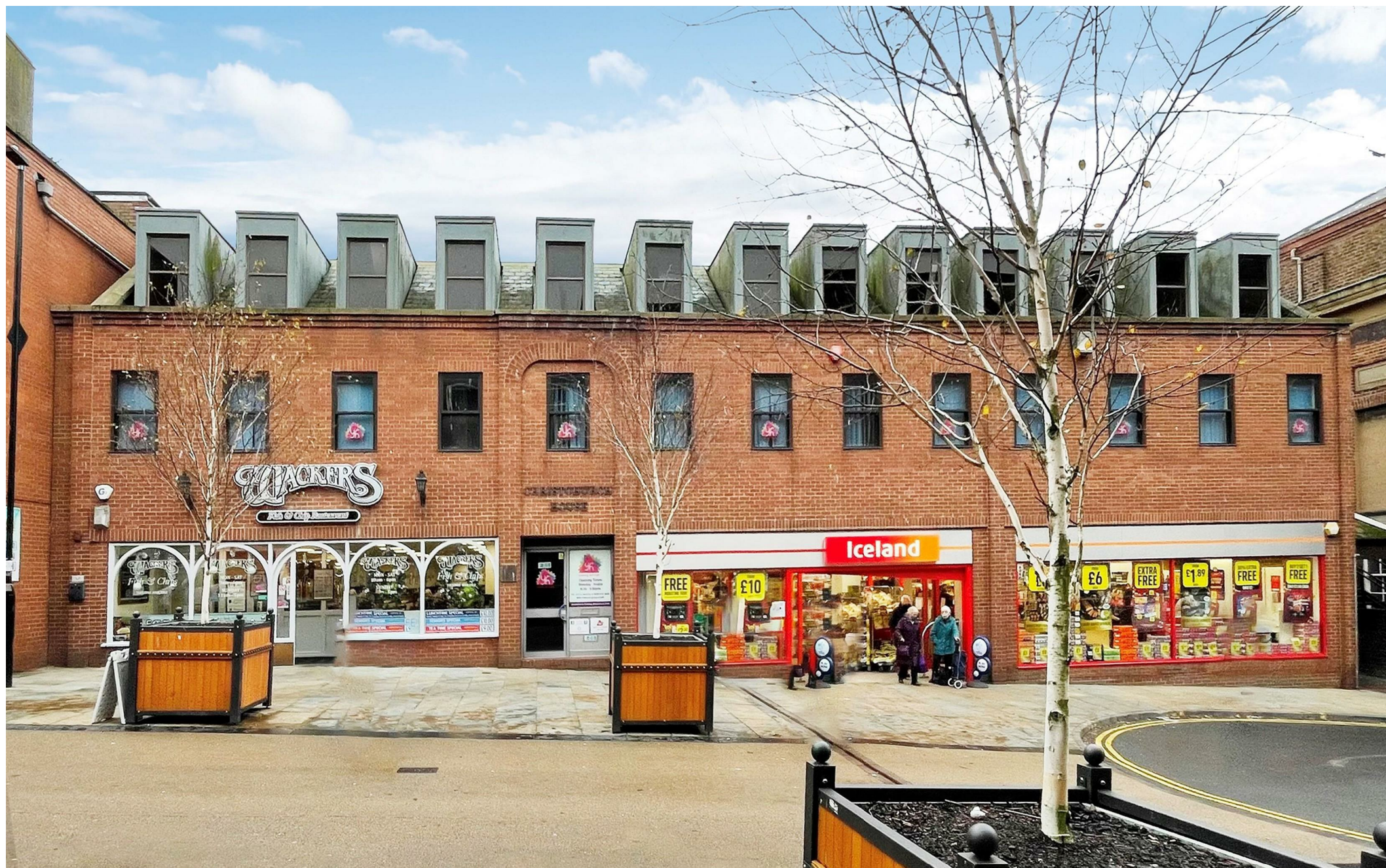
Christchurch House Vernon Road, Scarborough £9,000 Per Annum

Scotts 01482 325634 www.scotts-property.co.uk